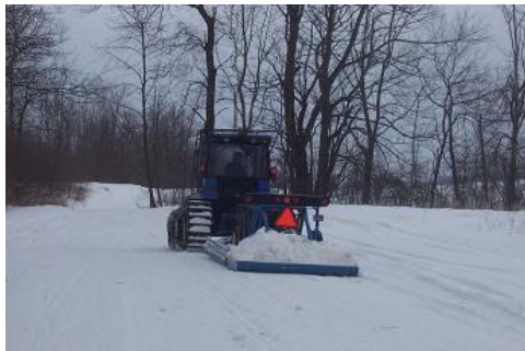
The New Holland on C7B near West Rd

all the way into the village of Knox. C7B enters the Knox Town Park and finds the junction with the Township local trail at the kiosk.