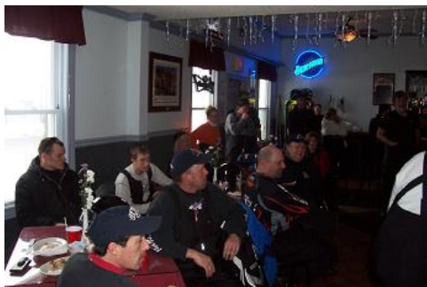
Club members in the Township Tavern

Taking a left onto the Township Trail will bring us down a part of the Heldeberg Escarpment. There are some nice