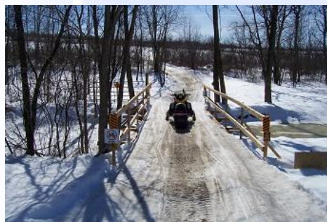
The Ball Field bridge in Knox

156. At the ball field the trail passes thru then crosses a bridge. Climbing a gentle hill will bring us to a junction with a local trail running over to the Highlands restaurant.