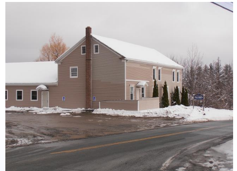
The Township Tavern

you reach the kiosk, turn left to continue into Knox. Be careful as you ride through the park as kids may be sledding on the slope. Once in town you will cross Rt