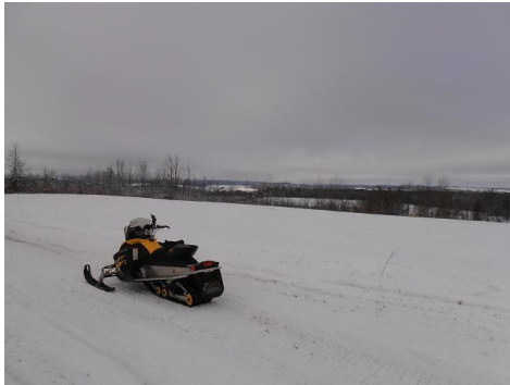
Looking west from above Knox

some low snow conditions. At the pipeline station the trail turns left. This area is high above the valley and offers some great views west toward Berne and Cobleskill! Next we descend into the valley between Berne and East Berne, riding toward the latter. After crossing Rt 443 the trail moves east along a stream at the base of a hill.