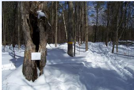
The Old Maple Tree junction

Up ahead is a junction that many will recognize as the 'Old Maple' tree. If you were to turn right you might have been able to ride down to the village of