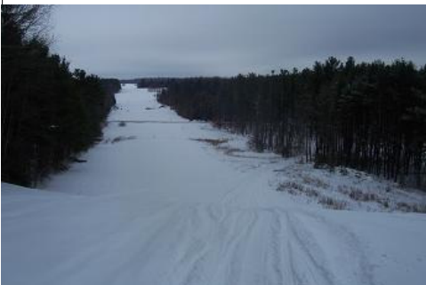
On the pipeline above Rt 146

Continuing on we find more field and light woods riding