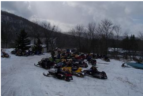
A full lot at the Maple Inn, East Berne

We cross that stream on a high steel deck bridge and arrive at the Maple Inn. Excellent food and beverage is served in a friendly atmosphere. There is fuel for your snowmobile just beyond the