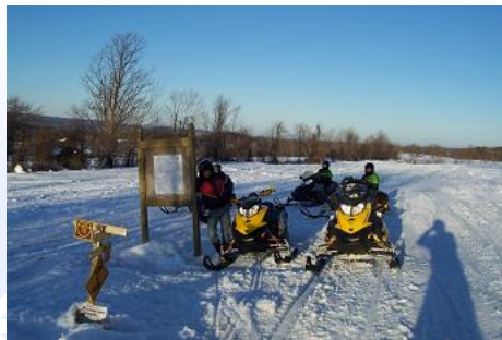
C7B & C7E junction near Quaker Street

We exit one woods and enter an airport. Be sure to follow all signs in this area. Staying on trail is critical here.