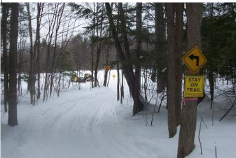
Exiting the woods at the airport

Schoharie on this unofficial trail. It is not maintained regularly and bridges are out. The trail should be avoided at this time.